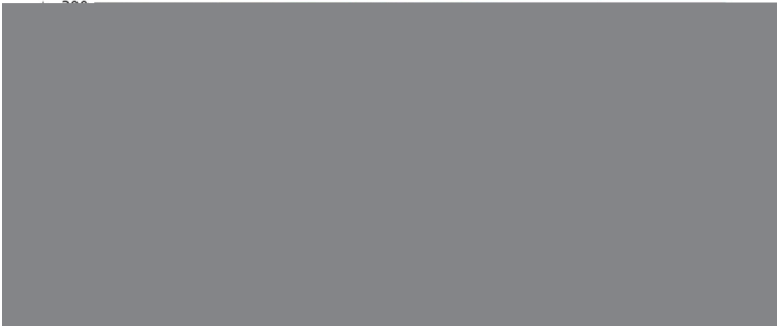
Spectral Power Distribution Colour - MASTERC CDM-TC 35W/842 G8.5 1CT/12