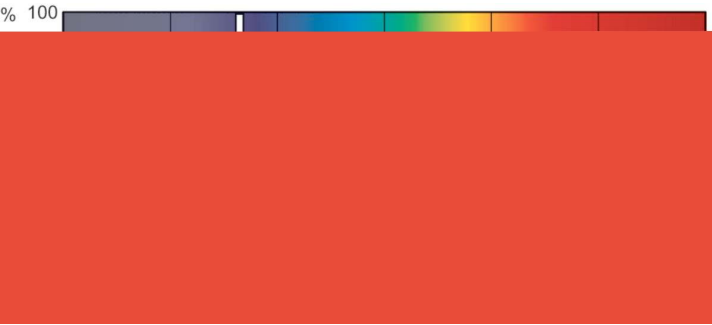
Spectral Power Distribution Colour - MSR 700 SA 1CT/4