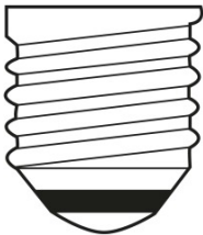
E27 IEC 7004-21