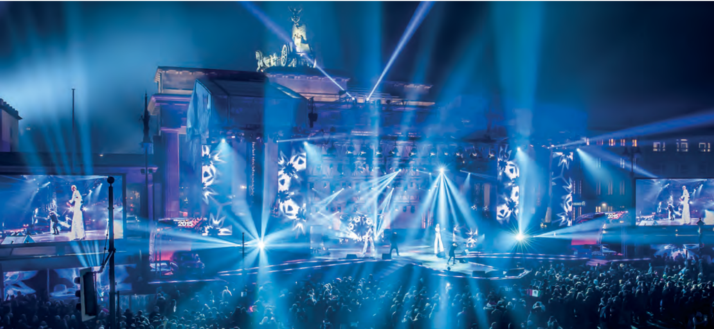
Light is enthusiasm. Celebrations at the Brandenburg Gate in Berlin, Germany, marking the 25 th anniversary of the fall of the Berlin Wall.

Stage performances, light shows, theatre and opera, clubs, TV studios – there’s a growing number of applications high performance lamps need to cover. That is why we have enhanced our Lok-it!® Power Series family to meet an even broader range of applications. Now there are specific lamps suited to the specific needs of the production – all easily identifiable from one another by the name, label, and the lamp base itself.