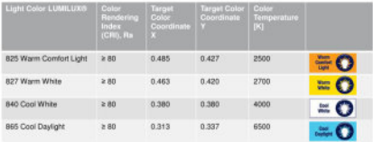
Light colors, color rendering properties and Light Color Coordinates for OSRAM DULUX® - lamps with integrated control gear

1. Datenebene / DRG CODE: Initial Technische Zeichnung: T17000-LUX OSRAM