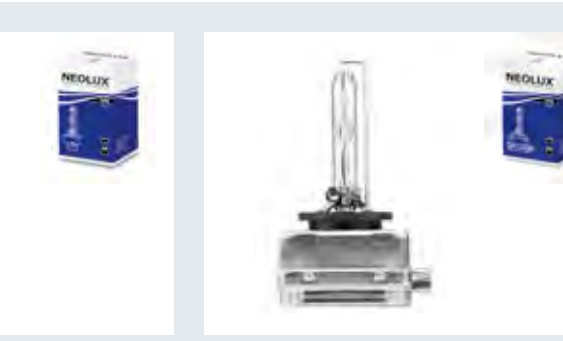
D3S | NX3S

NEOLUX recommends that xenon lamps should be changed by a qualified specialist.