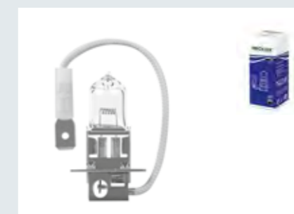
H3 | N460