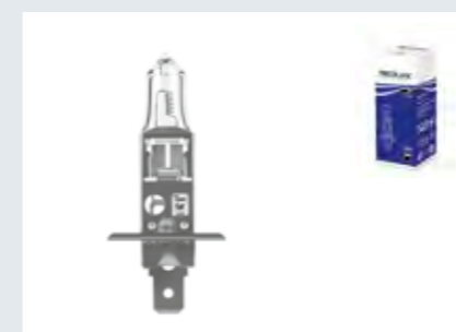
H1 | N466