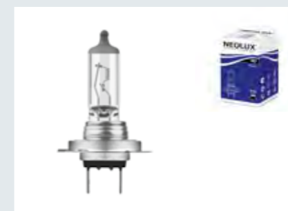
H7 | N499A