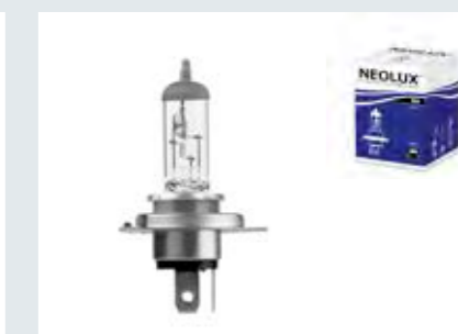
H4 | N475