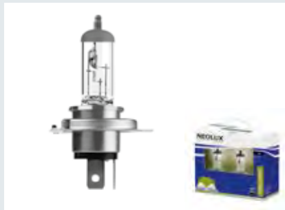
H4 | N472LL | Extra Lifetime