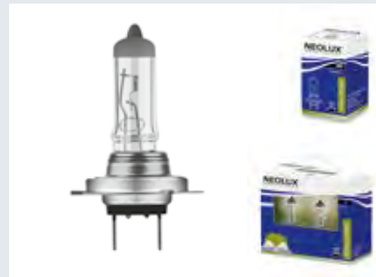
H7 | N499LL | Extra Lifetime