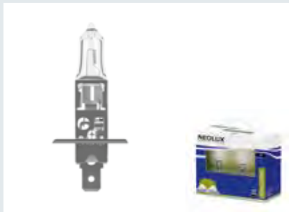
H1 | N448LL | Extra Lifetime