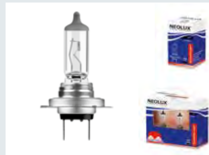
H7 | N499EL | +50% Extra Light