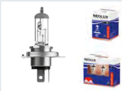
H4 | N472EL | +50% Extra Light