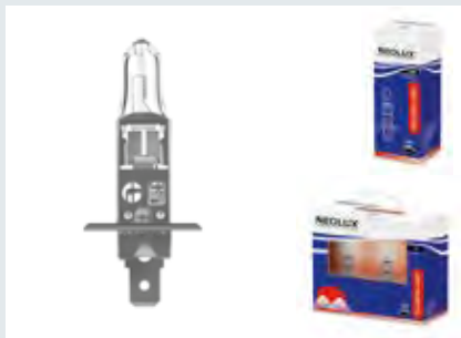
H1 | N448EL | +50% Extra Light