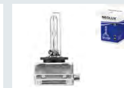
D3S | NX3S