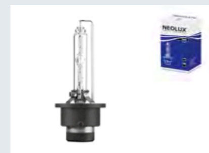
D4S | NX4S