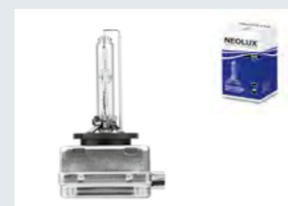
D1S | NX1S