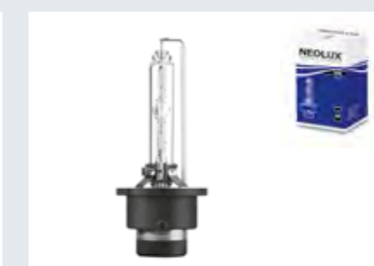
D2S | NX2S