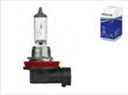
H8 | N708