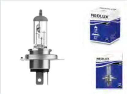
H4 | N472