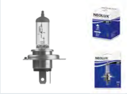
HS1 | N459