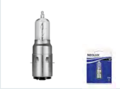
S2 | N395