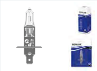
H1 | N448