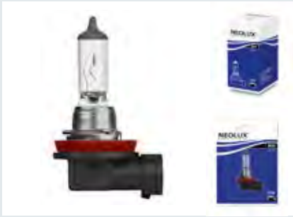
H11 | N711