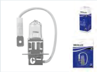
H3 | N453