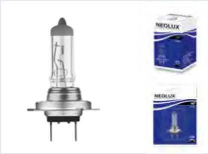
H7 | N499