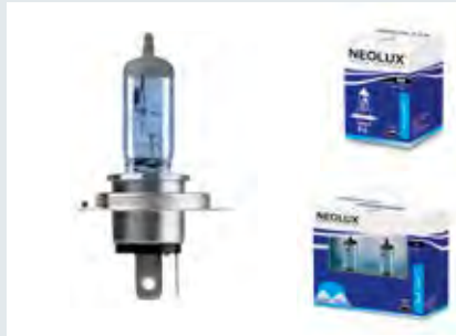
H4 | N472B | Blue Light