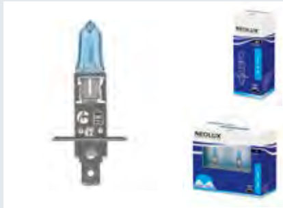
H1 | N448B | Blue Light