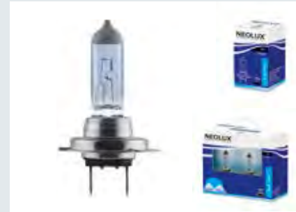
H7 | N499B | Blue Light