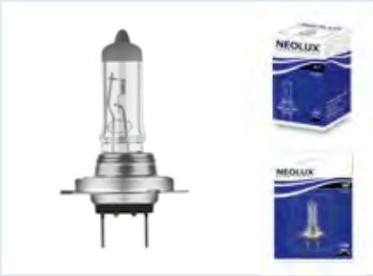
H7 | N499 | Standard