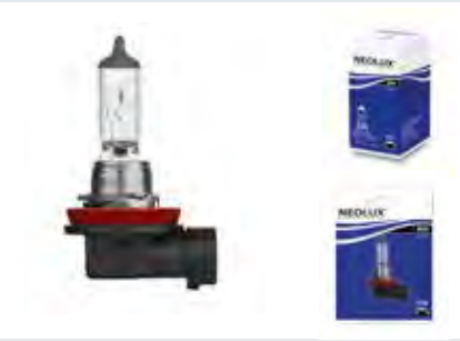
H11 | N711 | Standard