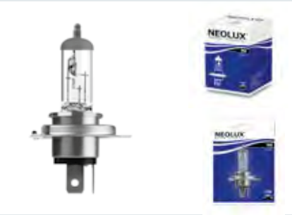
H4 | N472 | Standard