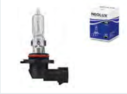
HB3 | N9005 | Standard