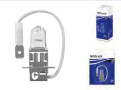
H3 | N453 | Standard