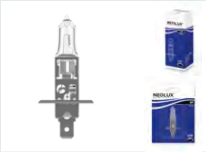
H1 | N448 | Standard