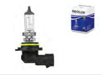
HB4 | N9006 | Standard