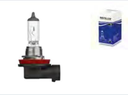
H8 | N708 | Standard