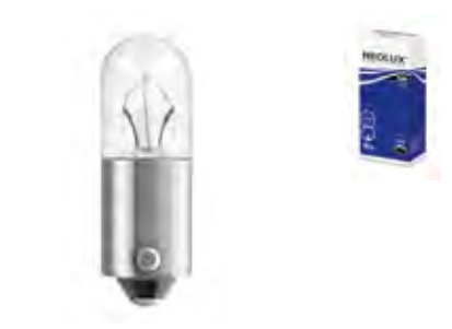
T4W | N233