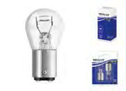
P21/5W | N380