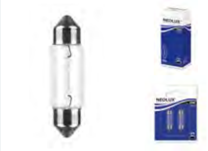
C5W | N239