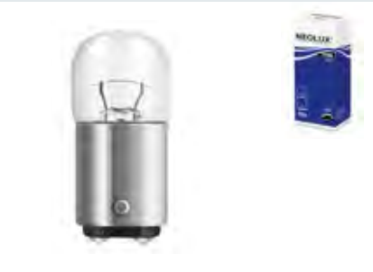
R5W | N209