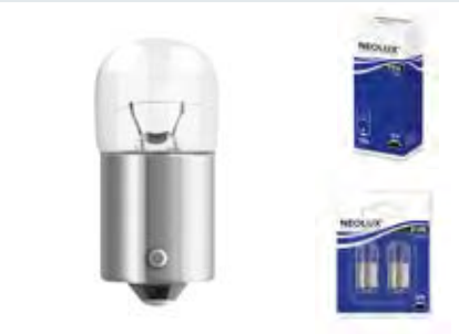
R10W | N245