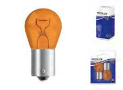
PY21W | N581