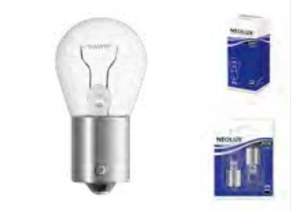
P21W | N382