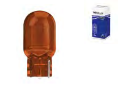
WY21W | N582A