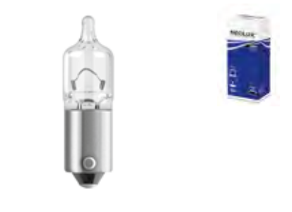
H6W | N434