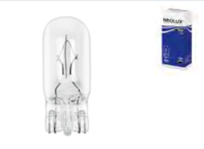
W3W | N504