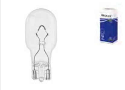
W16W | N921