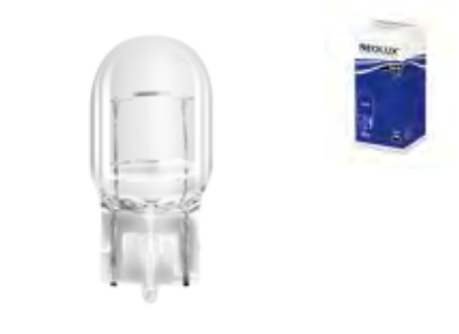
W21W | N582