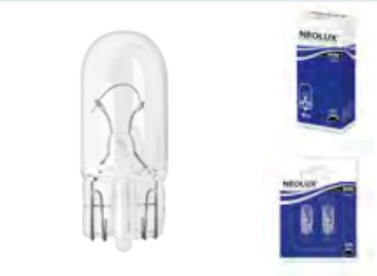
W5W | N501