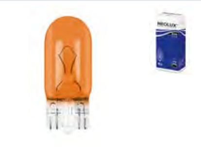
WY5W | N501A