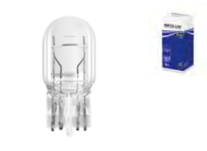
W21/5W | N580