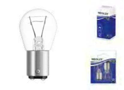
P21/4W | N566