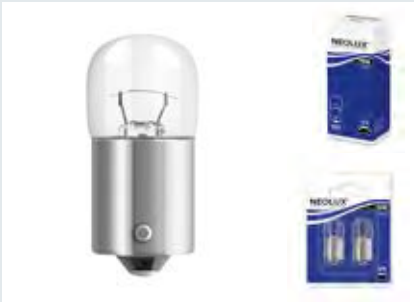
R5W | N207