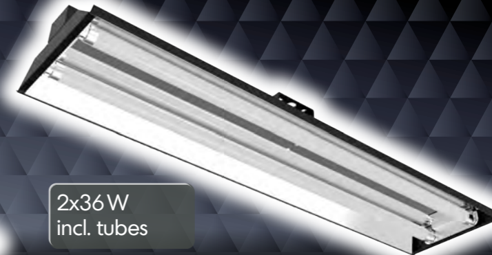
2x36W incl. tubes