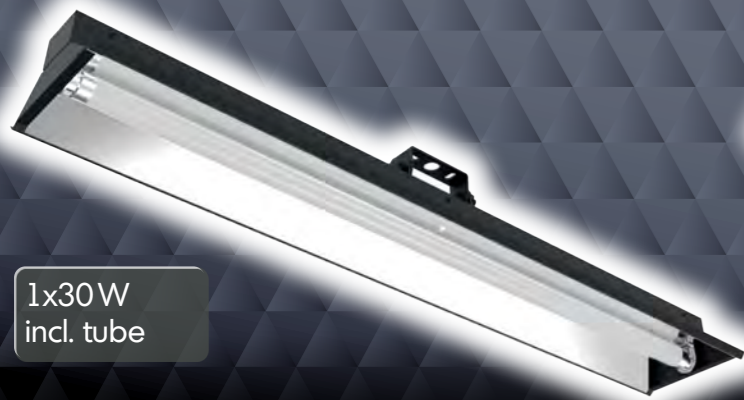
1x30W incl. tube